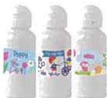
PERSONALISED DRINK BOTTLES